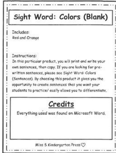
Terms of Use